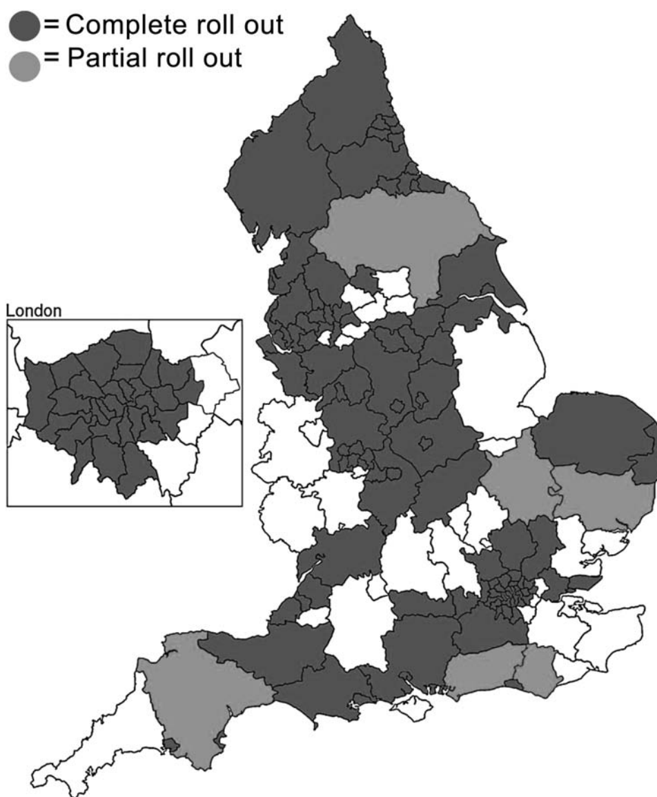
Figure 3 Extent of roll out of Bowel Cancer Screening Programme by primary care trusts in October 2008.

than women (1.5%) ( \chi^2=1445 , p<0.00001 ). This difference was of similar magnitude across all areas.